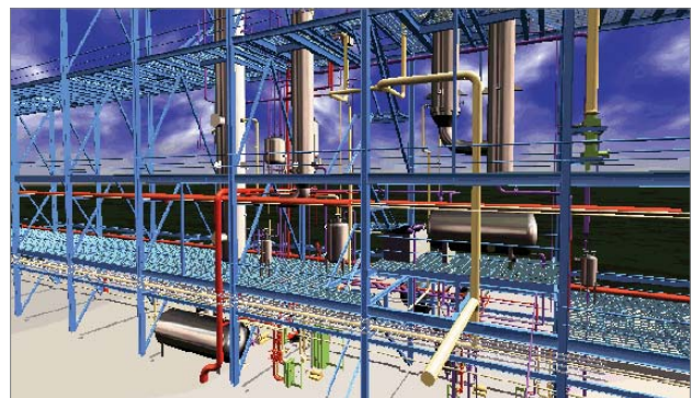
BASF A/S, Destillation Columns