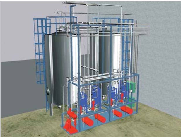
Process Module for WFI Distribution for CHRIST Nordic AB